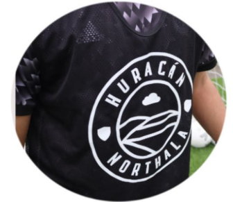
Kathleen Hannay Memorial Trust